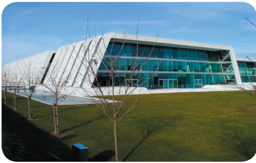
High tech industries are vital to the economy of Cambridge

Ride, close working with the bus company, a 'travel for work' programme and pioneering rising bollards to safeguard the town centre. Graham also explained the modelling which had been used to shape future policies.