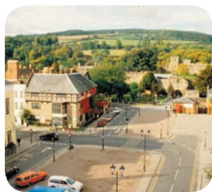
Ludlow market square

Despite public frustration at disruption inherent in undertaking the enhancement works, the scheme has been well received and acted as a catalyst for further private investment in conservation projects. The project also served to establish a working partnership between officers and members of all authorities and their advisors, setting a dialogue and team identity which may otherwise not have occurred.