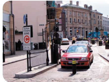
Durham: the charging point on exit